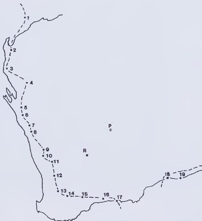
Figure 1. Southern portion of Western Australia showing the distribution of Aprasia in Western Australia. Dotted line indicates the inland limits of Aprasia species in Western Australia; the numbers the most inland records for various species: 1 ( A. rostrata Hermite I.), 2 ( A. fusca Bullara), 3 ( A. fusca 9 km E Point Cuvier), 4 ( A. smithi Towrana), 5 ( A. smithi Nerren Nerren), 6 ( A. smithi 46 km N Galena), 7 ( A. smithi East Yuna Reserve), 8 ( A. repens Eradu), 9 ( A. repens 15 km N Marchagee), 10 ( A. repens Coomberdale), 11 ( A. repens Wongan Hills), 12 ( A. repens York), 13 ( A. repens Lomos), 14 ( A. repens Dumbleyung), 15 ( A. repens Lake Magenta), 16 ( A. repens Oldfield River), 17 ( A. repens Esperance), 18 ( A. inaurita Vicinity of Toolina Rockhole), 19 ( A. inaurita Middini Beach). "R" indicates the Bungalbin sandplain population of A. repens and "P" the A. picturata localities.

R126998 an adult male collected 35 km E of Leonora in latitude 28° 57' 15" S, longitude 121° 47' 23" E by J Henry on 3 October 1996.